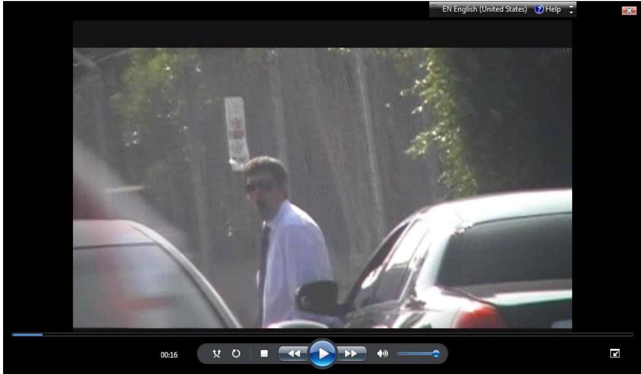
The Russian limousine driver, 6/19/09

What I didn't know was that this Russian guy was actually a "real" Russian surveillance agent whom the Russian consulate protection service had sent here to conduct surveillance on me. Again, they had to work within the Homeland Security system, so that the agent, disguised as a limousine driver, was using a surveillance iPhone to film me. Tired of waiting for me to get up, he went inside the car. But when I was getting up, the SVR officer inside the Homeland Security control center quickly ordered this idiot to come out of the car to film me with his iPhone – in order to obtain evidence that I was still wearing my jacket . Soon afterward, I got on the bus to go toward downtown. On the bus, another suspicious and freaky Russian old man appeared (1:24:00 in the recording and 0:52 in the video diary). While I thought the suit team was playing some tricks again, this was in fact another "real" Russian agent sent here to confirm once more that I was wearing my jacket. I fell asleep on the bus, and a new bus driver came up and made fun of me: "Good morning, good morning! How are you?" He said it with such a devilish smile, and feigned such courtesy when I was getting off the bus, that I wanted to punch him (2:00:00). The Russian driver and the sarcasm of the bus driver would cause me to spend half of the day assuming that the United States had succeeded in its forgeries and to wonder what the suit team had forged.